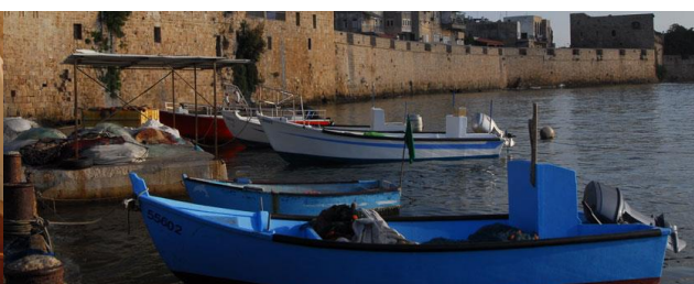
Marina & Fishing Port - Acre