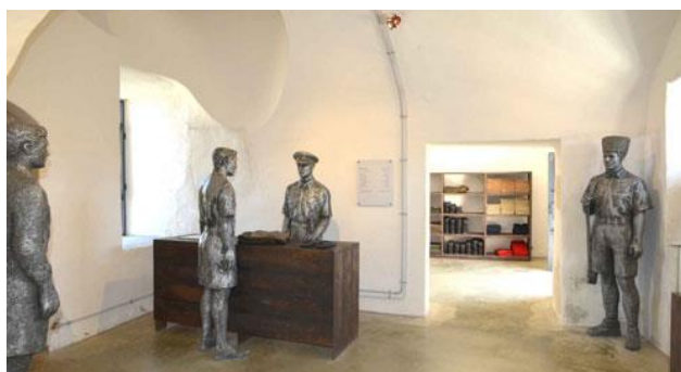
Underground Prisoners Museum - Acre