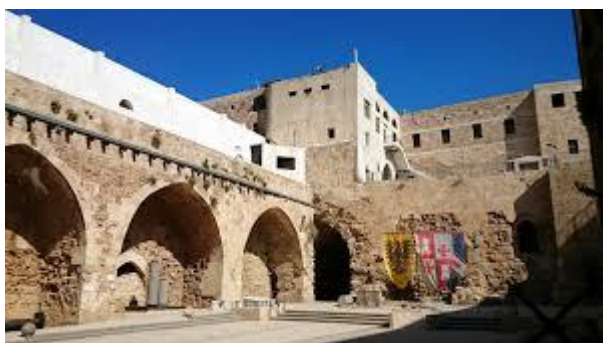
Crusader Fortress – Old City of Acre