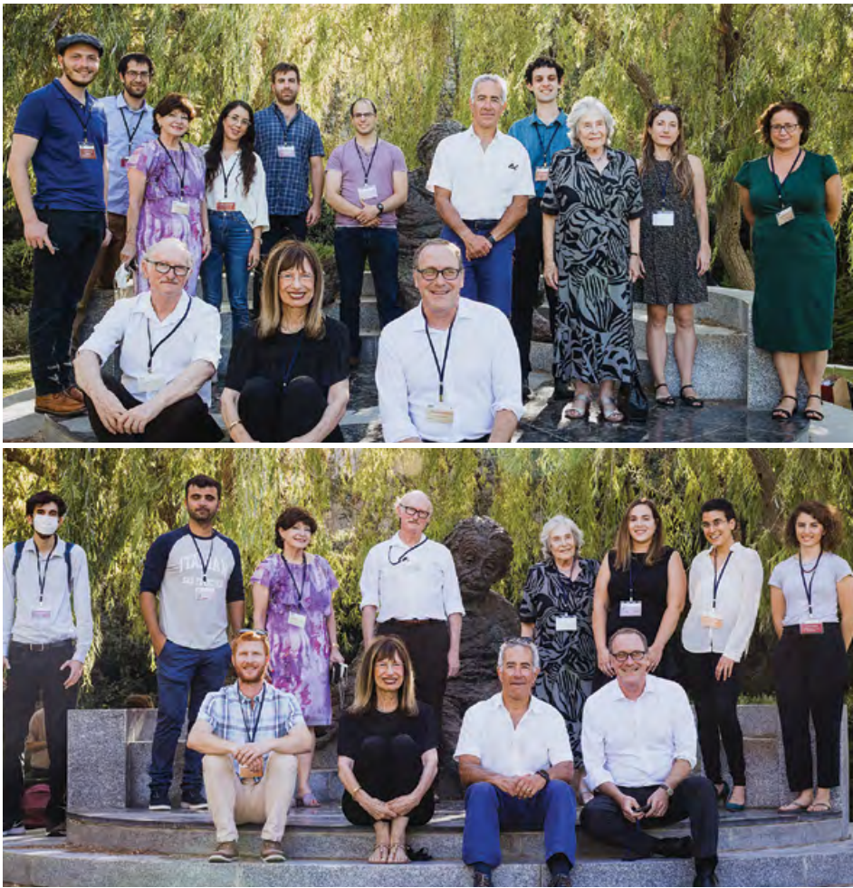
Adams Seminar August 2021; Top photo: Class of 2020; Bottom photo: Class of 2021